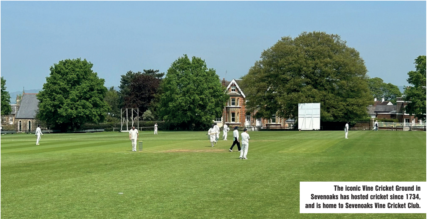
The iconic Vine Cricket Ground in Sevenoaks has hosted cricket since 1734, and is home to Sevenoaks Vine Cricket Club.

IN ASSOCIATION WITH WEST KENT SPORT AND WELLBEING MAGAZINE