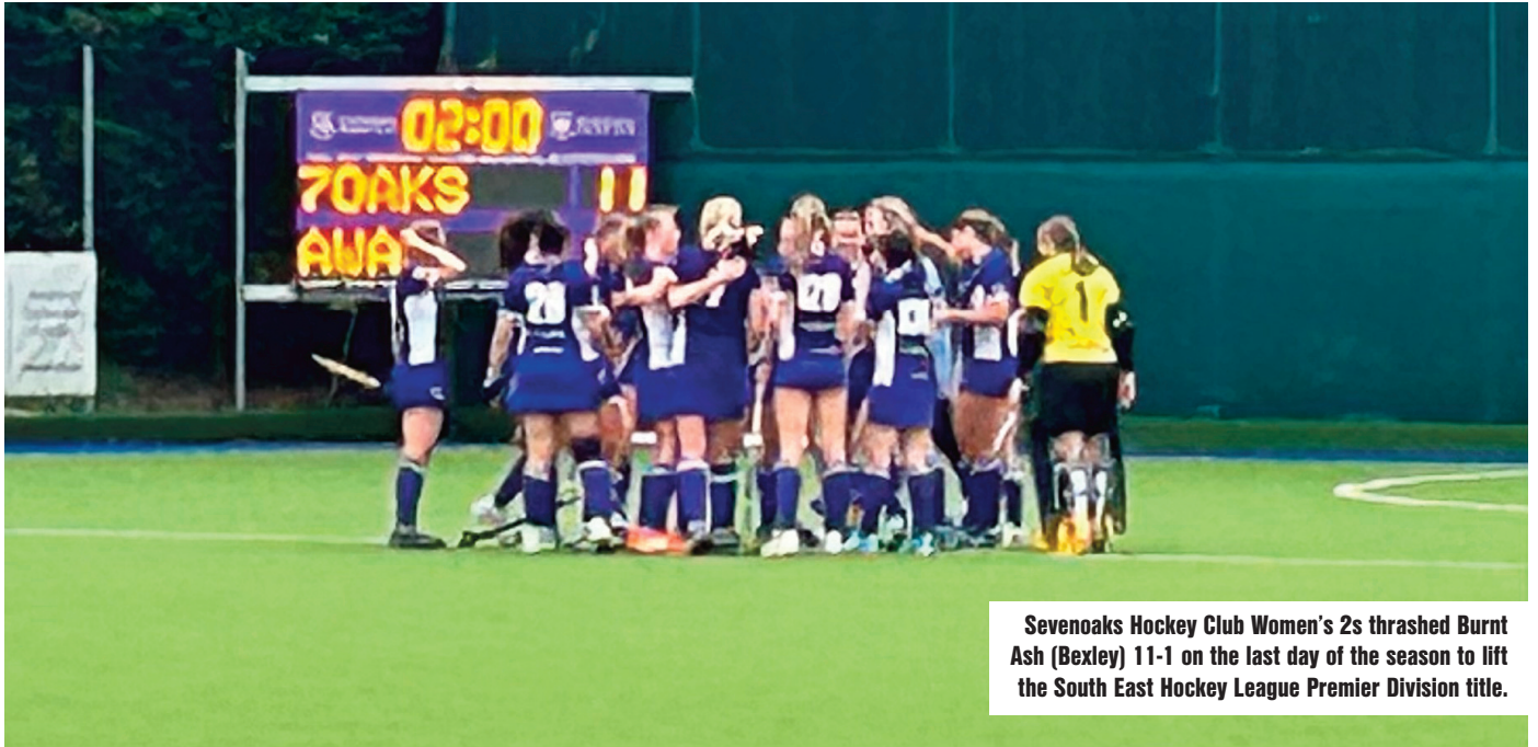
Sevenoaks Hockey Club Women's 2s thrashed Burnt Ash (Bexley) 11-1 on the last day of the season to lift the South East Hockey League Premier Division title.

IN ASSOCIATION WITH WEST KENT SPORT AND WELLBEING MAGAZINE