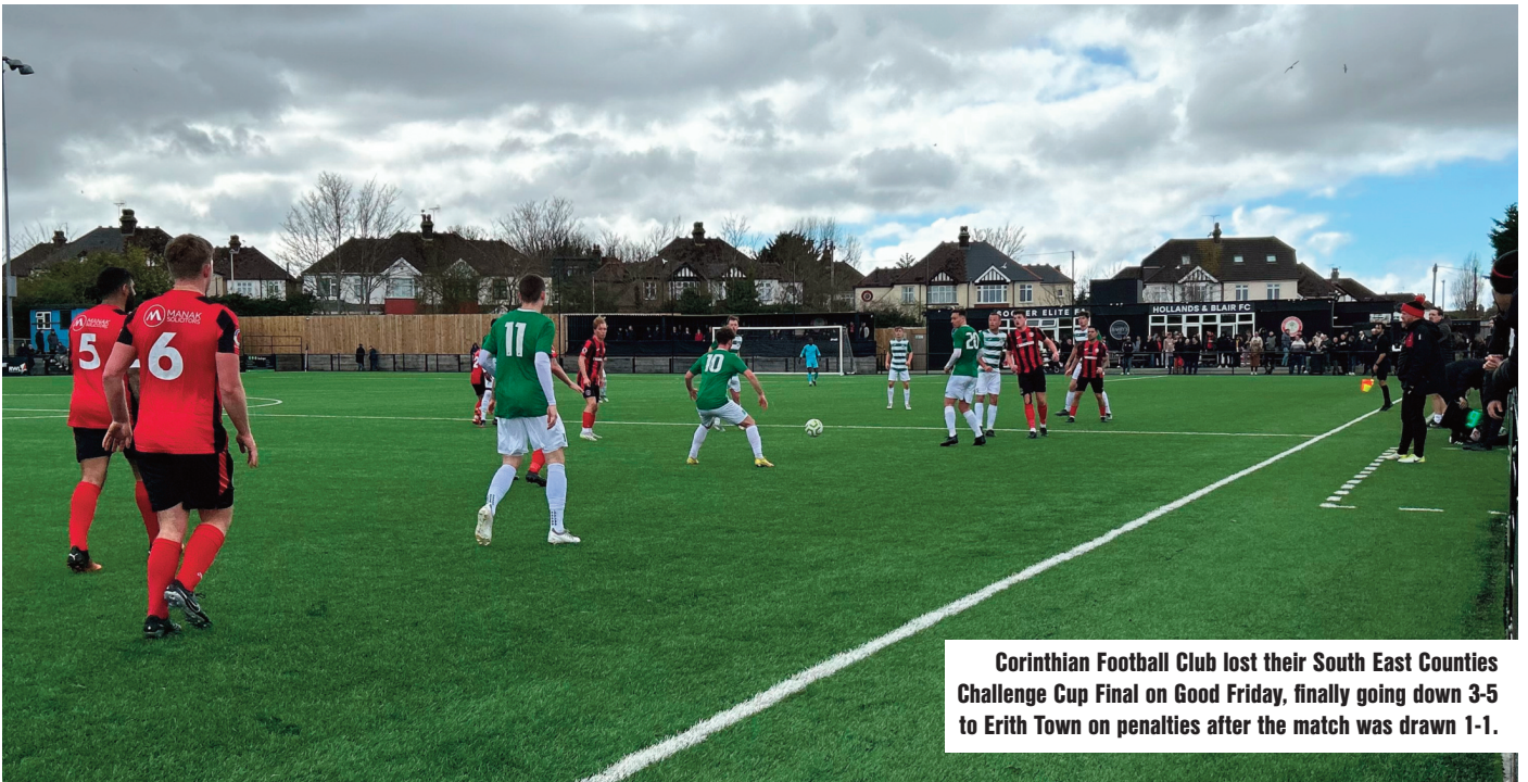
Corinthian Football Club lost their South East Counties Challenge Cup Final on Good Friday, finally going down 3-5 to Erith Town on penalties after the match was drawn 1-1.

IN ASSOCIATION WITH WEST KENT SPORT AND WELLBEING MAGAZINE