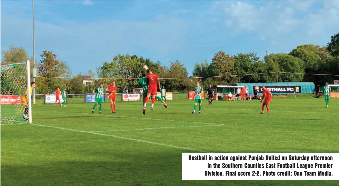
Rusthall in action against Punjab United on Saturday afternoon in the Southern Counties East Football League Premier Division. Final score 2-2.

THE AMHERST ACCOUNTANCY WEEKLY STATS REPORT IS POWERED BY ONE TEAM MEDIA