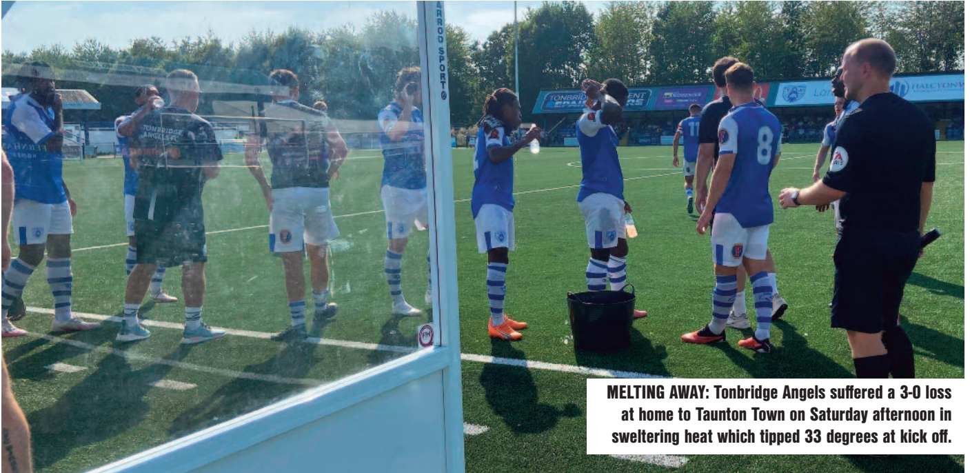
MELTING AWAY: Tonbridge Angels suffered a 3-0 loss at home to Taunton Town on Saturday afternoon in sweltering heat which tipped 33 degrees at kick off.

THE AMHERST ACCOUNTANCY WEEKLY STATS REPORT IS POWERED BY ONE TEAM MEDIA